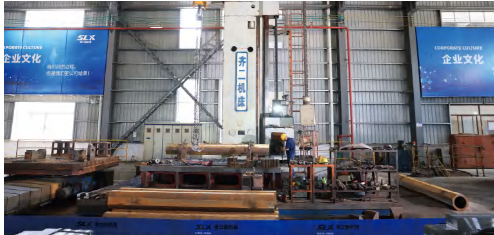
齐二 T6920 镗床