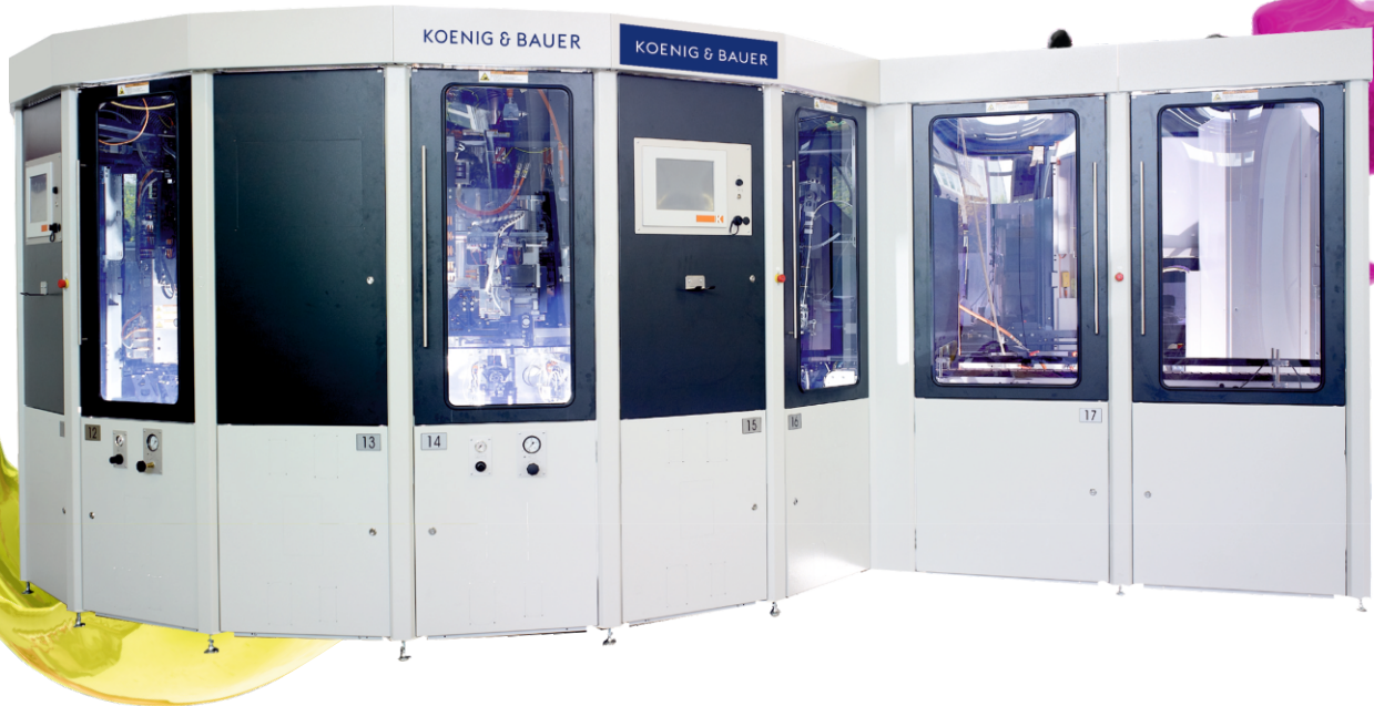
High Speed Family- The Fast One