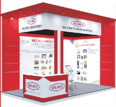
Packaging & Bonding Solutions