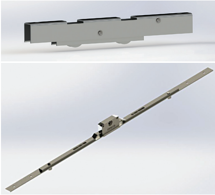
Hardware from OBEN for uPVC doors and windows

O BEN, one of the system providers for uPVC windows and doors, offers customised Corrosion Resistant Hardware for uPVC systems.