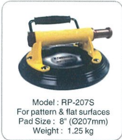
Model : RP-207S For pattern & flat surfaces Pad Size : 8" (Ø207mm) Weight : 1.25 kg