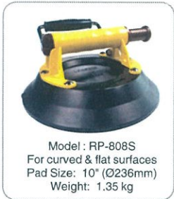
Model : RP-808S For curved & flat surfaces Pad Size : 10" (Ø236mm) Weight : 1.35 kg