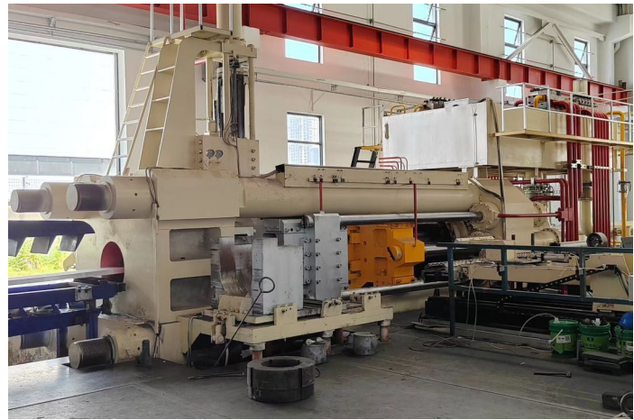
3000MT SHORT STROKE BACK LOADING ALUMINUM PRESS