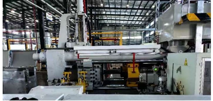
1450MT SHORT STROKE FRONT LOADING ALUMINUM PRESS