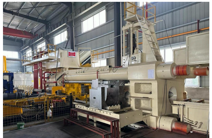
4000MT SHORT STROKE BACK LOADING ALUMINUM PRESS