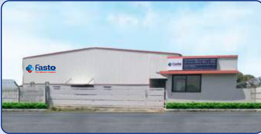
World Class ISO Certified Manufacturing Unit