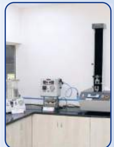
R&D and QC Lab