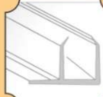
Plastic Profiles Sliding Door Seal