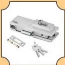
PATCH LOCK SS304 PLATES WITH BRASS KEYS & CYLINDER