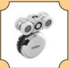
SLIDING ROLLERS SS304 A2 (CP POLISHED )