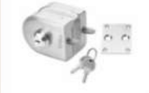
Mini Single Door Lock (Key & Knob)