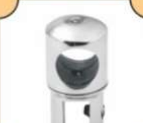
Rod to Glass