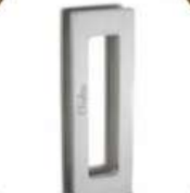
Sliding Handle (Rectangle)