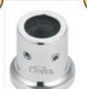
Wall to Rod