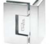
Glass to Glass 90° Hinge