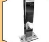
Railing Pillar 8"