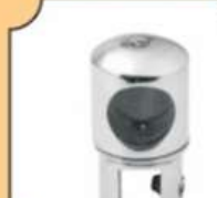
Rod To Glass (One Slide Blind)