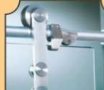
Office Sliding Roller