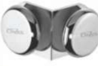
Glass to Glass 90°