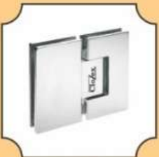
HEAVY DUTY SS304 SHOWER HINGES