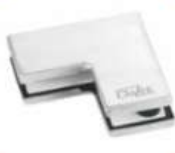
SMALL L PATCH