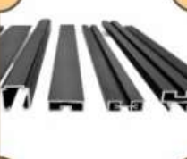
Slim Profile 16x45