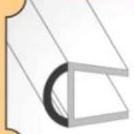
Plastic Profiles D Seal