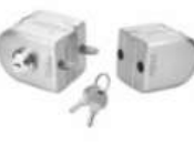
Mini Double Door Lock (Key & Knob)