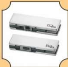
TOP & BOTTOM PATCH SS304 PLATES WITH STEEL INSERTS