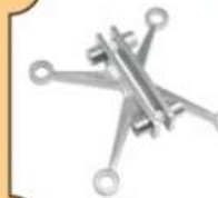
Four Way Spider