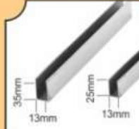
'U' Channel (For Fixed Glass)