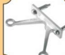
Two Way Spider