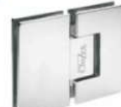
Glass to Glass 180° Hinge