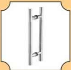
HIGH STRENGTH HANDLE WEIGHT APPROX. 1.2 KG