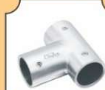
Rod to Rod Connector