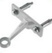
One Way Spider