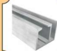
Aluminium Track (Door+Fix Glass)