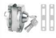
Single Door Lock (Key & Knob)