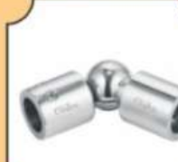
Rod to Rod