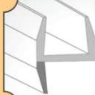
Plastic Profiles Side Seal