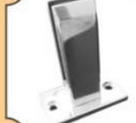
Railing Pillar 5"