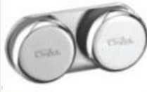
Glass to Glass 180°