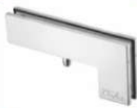
BIG L PATCH