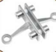
Two Way Spider 180°