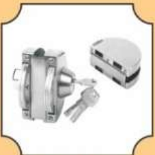
D LOCKS WITH BRASS KEYS