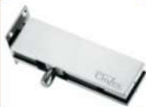
Wall mounted over panel patch with pivot (Over Panel)