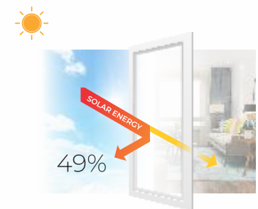
Solar Energy Rejection