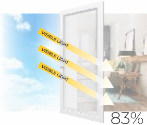
Visible Light Transmittance