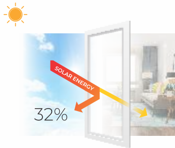
Solar Energy Rejection

Reduce Heat Causing IR Rays with Cosmo Sunshield Ultra Cool Series