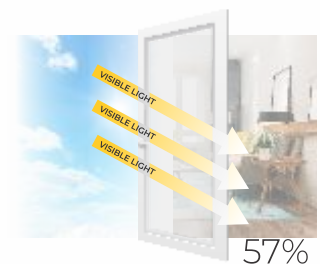
Visible Light Transmittance