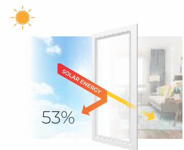
Solar Energy Rejection

Unmatched solar defense, elevated living.