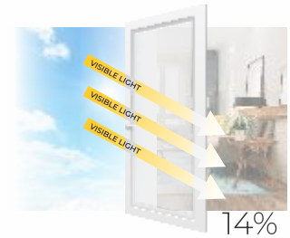
Visible Light Transmittance