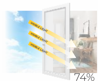
Visible Light Transmittance