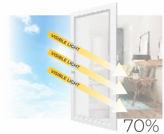
Visible Light Transmittance