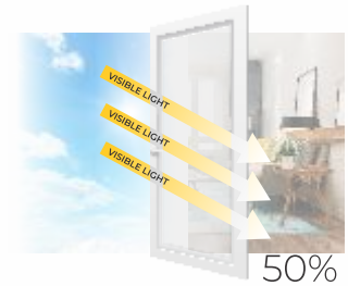
Visible Light Transmittance