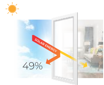
Solar Energy Rejection