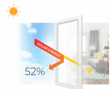
Solar Energy Rejection