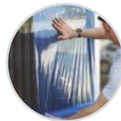
For Glass & Window