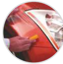
For Finished Surface