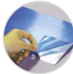
For Steel Sheets & Aluminum