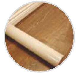
For Furniture & Wood