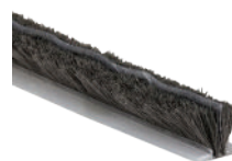
Fin Weather Strip