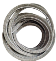
Non-Silicone Weather Strip