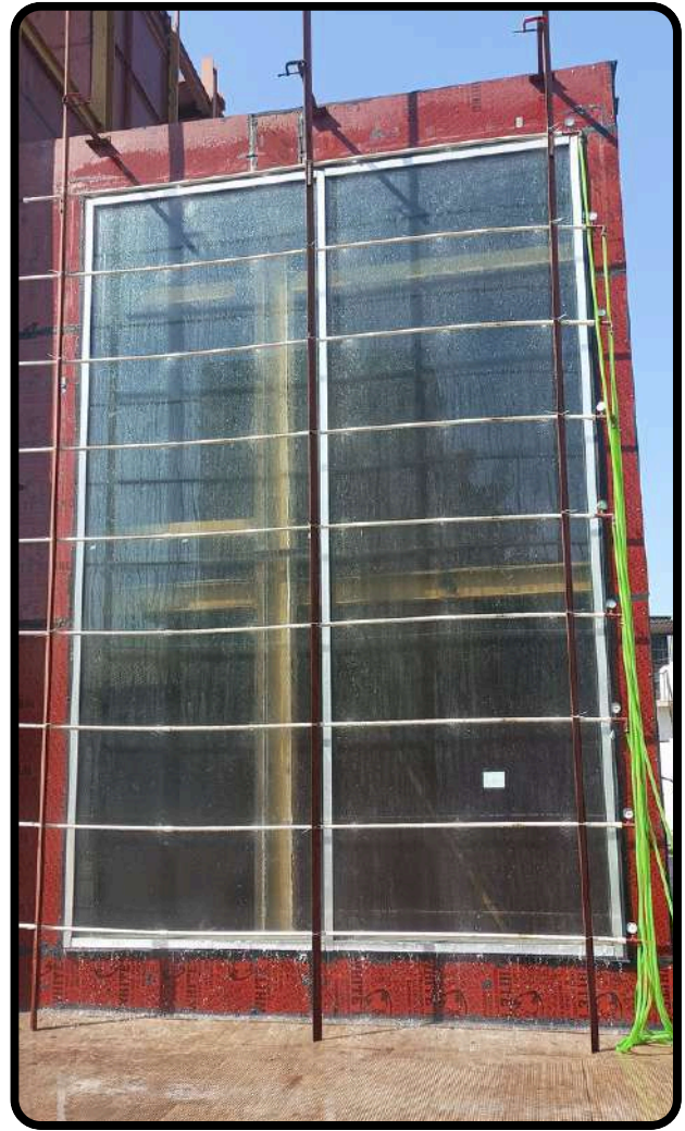
Pressurized Chambers ...