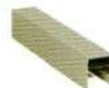
Top and Bottom